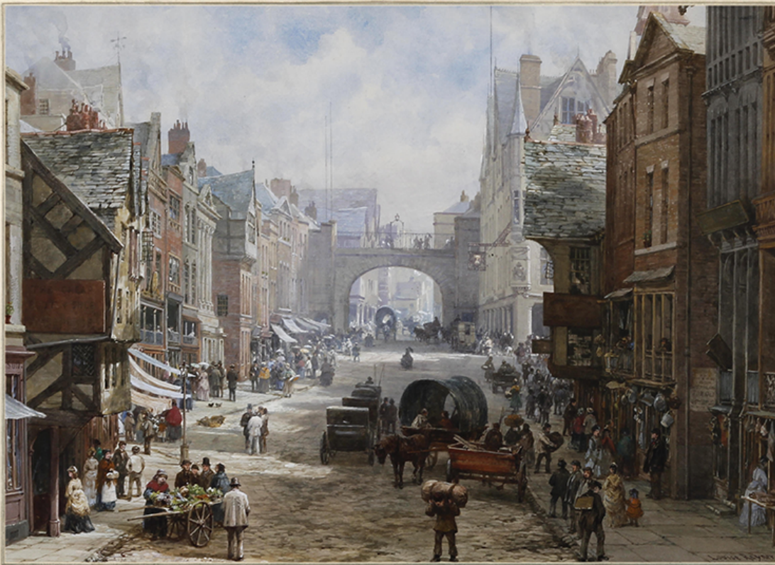
WATERDEEP'S TRADES WARD

Killian (LN male human guard MM 347) is an honest and concerned citizen, who is planning an unauthorized sting operation on a drug den called Dankmire in the South Ward. He has assembled a handful of reliable fighters who will support him. The Dankmire is a true hornets' nest. 20 drugged bandits (MM 343) hide in secret rooms beneath the Dankmire and defend the joint to the last man. After the dust has settled, the city guard appears and attempts to arrest the remaining combatants. The characters can prevent an arrest by succeeding on a DC 15 Charisma (Persuasion) check .