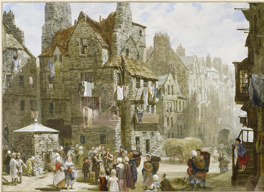
WATERDEEP'S SOUTH WARD

The soldiers stationed at East Torch Tower suspect that a vengeful spirit or ghost is responsible for the strange occurrences. At first, commander Artun disregarded these rumors as mere superstition. However, after 3 of his guards were seriously wounded he is taking the matter more seriously. Artun suspects foul play, but an internal investigation came up with nothing. The culprit is a possessed guard named Brennan, and a character with a passive Wisdom (Insight) of 14 or higher notices his suspect behavior and inconsistencies in his story. Brennan, who can enter and leave the tower as he pleases, poisons the rations as well as other utensils whenever he sees an opportunity. The vengeful ghost (MM 147) who possesses Brennan is that of Jeremy Mon, a man driven to suicide by his comrades. Jeremy's spirit passes into the afterlife peacefully when his former comrades at East Torch Tower apologize to him at his grave in the Field of the Dead. Otherwise Jeremy only finds rest after all the guards who tormented him are dead.