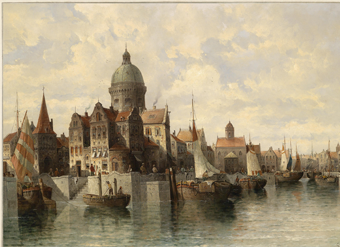
WATERDEEP'S DOCK WARD

There is great cause for concern. The relationship between Waterdeep and Luskan is at an all-time low, and this incident could lead to a full-scale war. Currently, the Waterdhavian diplomats are working tirelessly to pacify their Luskan counterparts. Captain Kolden is sure that the flag was stolen by an enemy agent to justify a war. In reality, a pair of drunk students stole the flag, which now flies in the students' humble abode in the South Ward. One of the students, named Icarium (CN male half-elf apprentice wizard VGTM 209), stole a potion of flying from a tutor's office and used it to swipe the flag directly from the pole. An old man who needed to relieve himself saw the flying student in his school uniform of the Watchful Order of Magists and Protectors, but nobody believes him since he is senile.