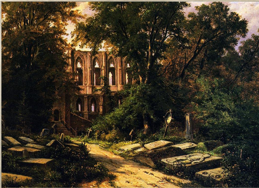
CITY OF THE DEAD

The official note on the board is just a pretext to recruit help in a more serious matter. Once the characters arrive, Director Gloin Gloinson informs them about the real problem: a person is cooking the books and embezzling parts of the gem shipments arriving to the city. The culprit can only be a disgruntled employee working in the guild hall, since no one else has access to the books. Gloinson tasks the characters to act as simple guards while covertly searching the guildhall for clues. The person responsible is Gloinson's new wife, Ebba (NE female elf mage MM 347), who is a secret agent of Xanathar's Thieves' Guild. She uses spells such as suggestion and modify memory on Gloinson to divert the shipments in question. The modify memory spell replaces the mage's cone of cold spell.